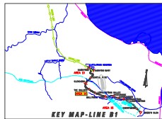
KEY MAP-LINE B1